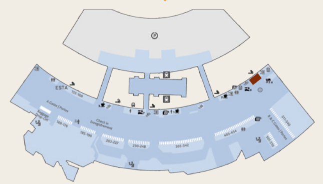
Located near Gate C, before security on Level 2 (departures) in Terminal 3