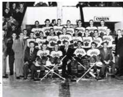
Hockey Hall of Fame