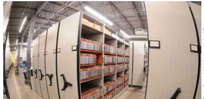
▲ The world's largest collection of hockey periodicals is stored in 11 of the 75 high-density rolling-storage units at the D.K. (Doc) Seaman Hockey Resource Centre.