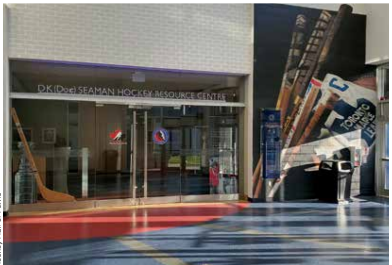
Hockey Hall of Fame