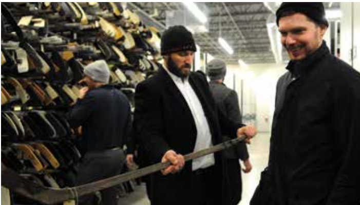
▲ Alexander Ovechkin (centre) grips a stick circa 1910s during his visit to the D.K. (Doc) Seaman Hockey Resource Centre on February 20, 2019, on the same day his Washington Capitals donated a 2018 Stanley Cup ring to the Hall of Fame.