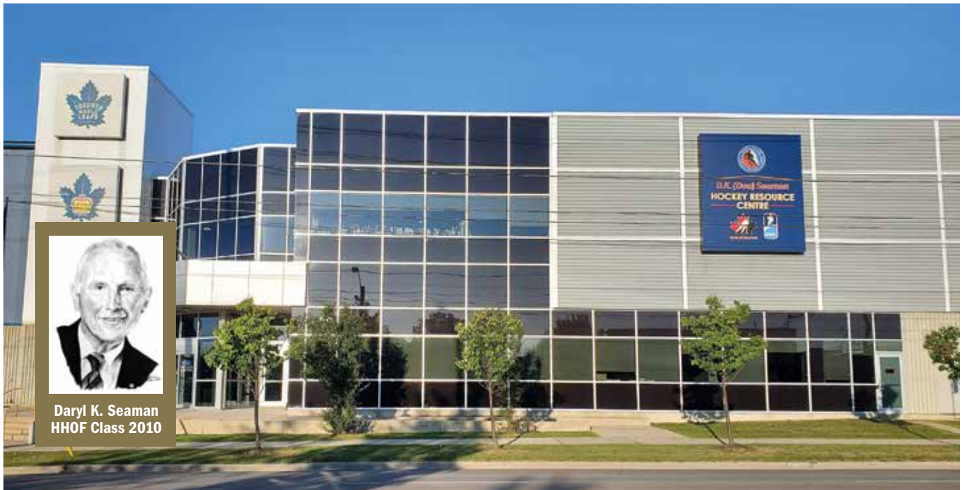
Hockey Hall of Fame

▲ The D.K. (Doc) Seaman Hockey Resource Centre is located within the four-pad arena complex at 400 Kipling Avenue in Toronto, a multi-purposed facility that also serves as the practice facility for the Toronto Maple Leafs and Marlies, as well as offices of Hockey Canada and the NHL Alumni.