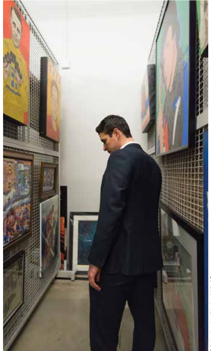
▲ During a team visit in 2017, Sidney Crosby examines some of the Hall of Fame's original art pieces at the D.K. (Doc) Seaman Hockey Resource Centre which includes a portrait of Honoured Member Rod Gilbert by famed artist, Andy Warhol (pictured behind Crosby).